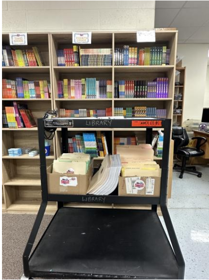
RIF cart with tip sheets